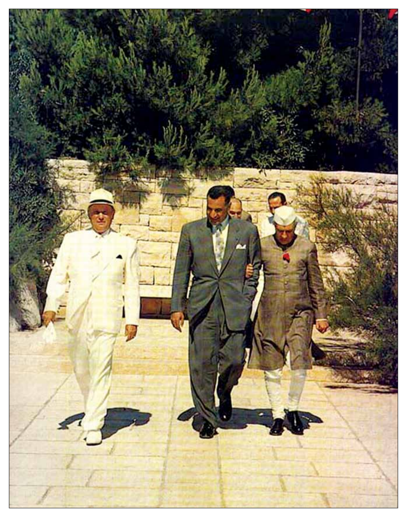
Fig. 5: Tito, Nasser and Nehru on the Brioni Islands, July 1956. Sl. 5: Tito, Naser in Nehru na Brionih, julij 1956.