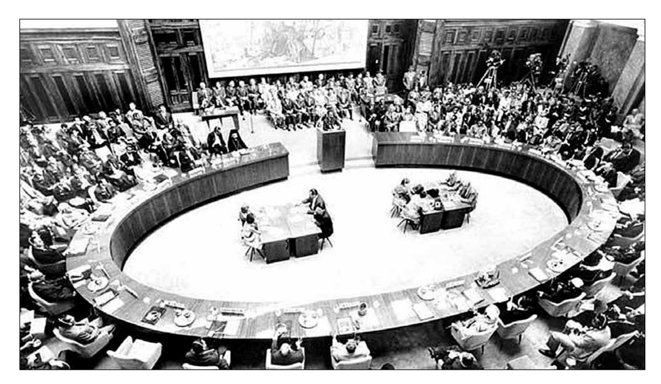
Fig. 7: Summit of Non-Aligned, Yugoslav Federal Assembly, September 1961. Sl. 7: Vrh neuvrščenih v jugoslovanski zvezni skupščini, september 1961.

a resolution urging the superpowers to resume peace negotiations. To that end, Yugoslav mission in New York hosted a meeting on September 29, between Nkrumah, Nehru, Sukarno, Nasser and Tito, who announced their joint resolution in the General Assembly.<sup>6</sup> The resolution did not pass, but it did gain visibility. The timing was right as the topic of this General Assembly session was admitting 16 African countries for membership, a trend which Yugoslavia supported wholeheartedly through the Declaration on the Granting of Independence to Colonial Countries and Peoples in December 1960.