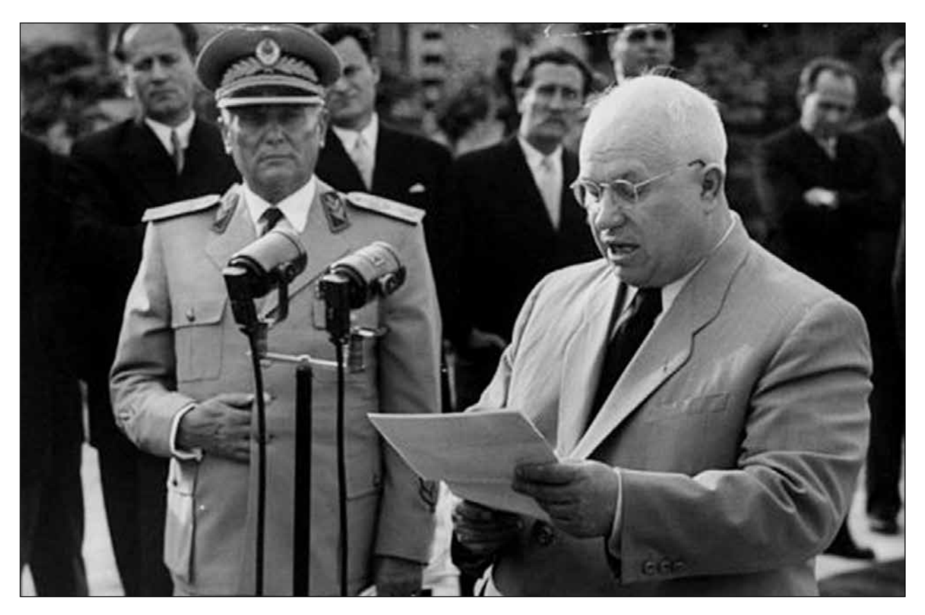
Fig. 4: Tito receives Soviet delegation in Belgrade, June 1955. Sl. 4: Tito sprejema sovjetsko delegacijo v Beogradu, junij 1955.

Tito proved a gracious host, as he was an eager guest. Belgrade hosted the Belgian minister of foreign affairs and former Belgian Prime Minister Paul Henri Spaak in November 1952. From the United States, the leader of the Democratic Party, Adlai Stevenson, arrived in June 1953, followed by French former Prime Minister Pierre Mendès. In March 1954, Yugoslavia was visited by minister of foreign affairs of Burma Sao Hkun Hkio, followed by the Emperor of Ethiopia Haile Selassie in July. (Radenković, 1970, 69–131). However, a real sensation occured with the announcement that the high delegation of state and party leadership of USSR would visit the country. The New York Times described the event as "Soviet Canossa", reversed insofar as the communist pope went to pay homage to the renegade king (NYT, 25 May, 1955). The Yugoslav press savored this triumph, dwelling on the details such as Tito's dignified posture at the Belgrade airport where he met Nikita Khrushchev and Nikolai Bulganin (Dimić, 1997, 36-68). Behind closed doors, however, tense but meaningful exchanges between the delegations attested to the increased impor-