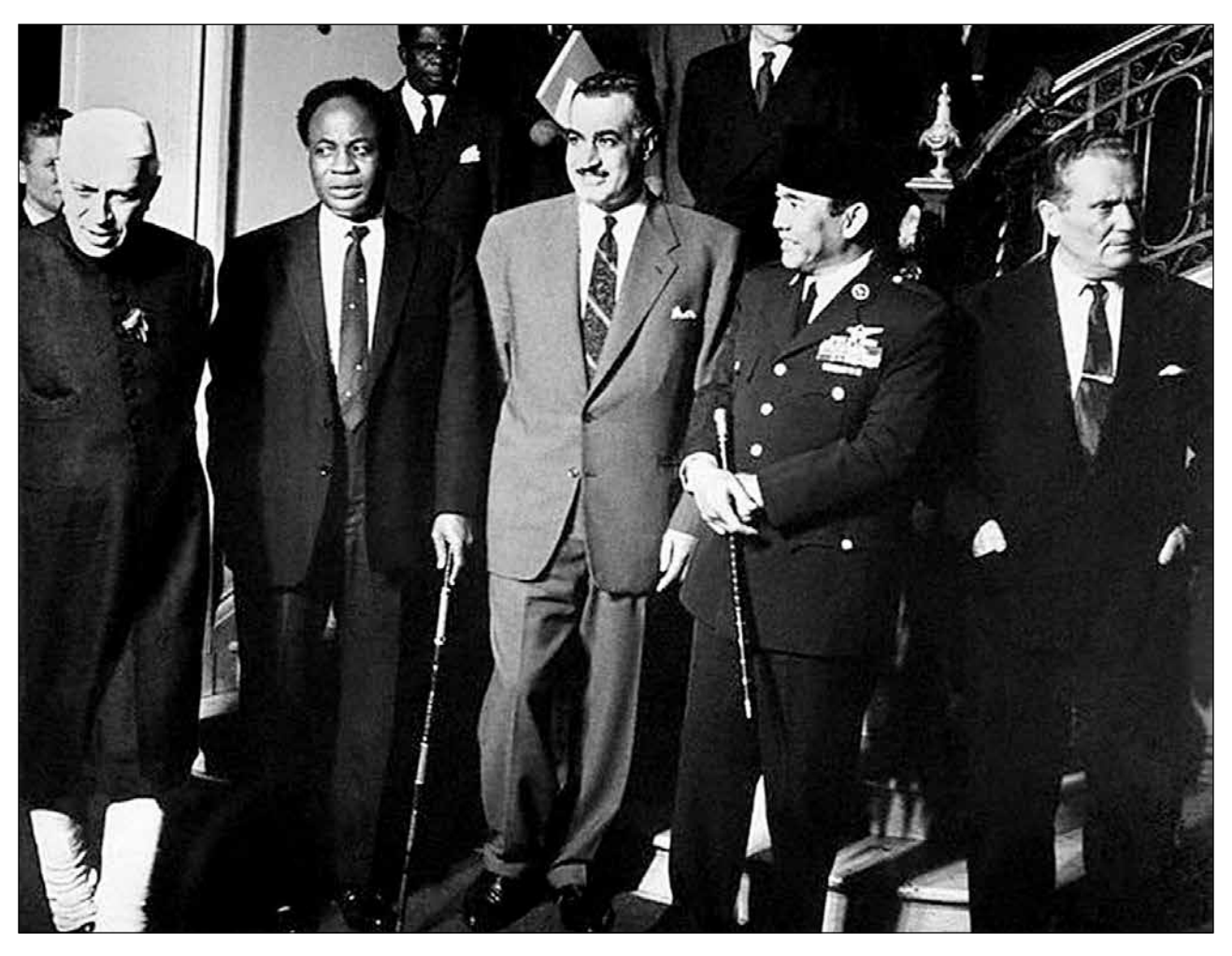
Fig. 6: Nehru, Nkrumah, Nasser, Sukarno and Tito in New York, September 1960. Sl. 6: Nehru, Nkrumah, Naser, Sukarno in Tito v New Yorku, september 1960.