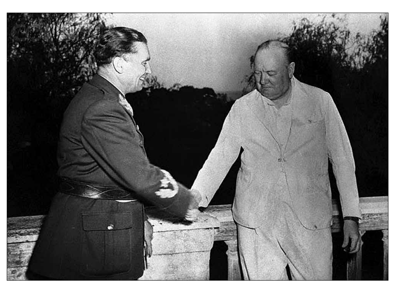
Fig. 1: Tito and Churchill in Naples, August 1944. Sl. 1: Tito in Churchill v Neaplju, avgust 1944.

of transition, foreign policy was technically conducted through the State Secretariat for Foreign Affairs (DSIP), headed by prewar diplomats Ivan Šubašić (1943–1945), Josip Smodlaka (1945) and Stanoje Simić (1946–1948). However, the "old" diplomacy was out, and its representatives were not trusted (Petković, 1995, 18-37). The true conduct of international relations was determined in the Politburo of the Communist Party, and much of diplomatic exchange was conducted by Tito himself, through his official visits. His itinerary left no doubts about his ideological and geopolitical leanings: he avoided the West and cruised the East. In 1945, he visited the USSR, then Poland and Czechoslovakia (1946), the USSR again in 1946, then Bulgaria, Hungary and Romania the following year (Petranović, 1987, 5–29; Sovilj, 2007, 133-153). His chief press secretary recollects that "the visits were conducted according to the patterns of the times. Public speeches were mentioning the countries of people's democracies, which have 'a great friend in the USSR, invincible country of socialism'. They were completed with the signing of a treaty of friendship, mutual help and cooperation, according to the template of the same treaty signed before all oth-