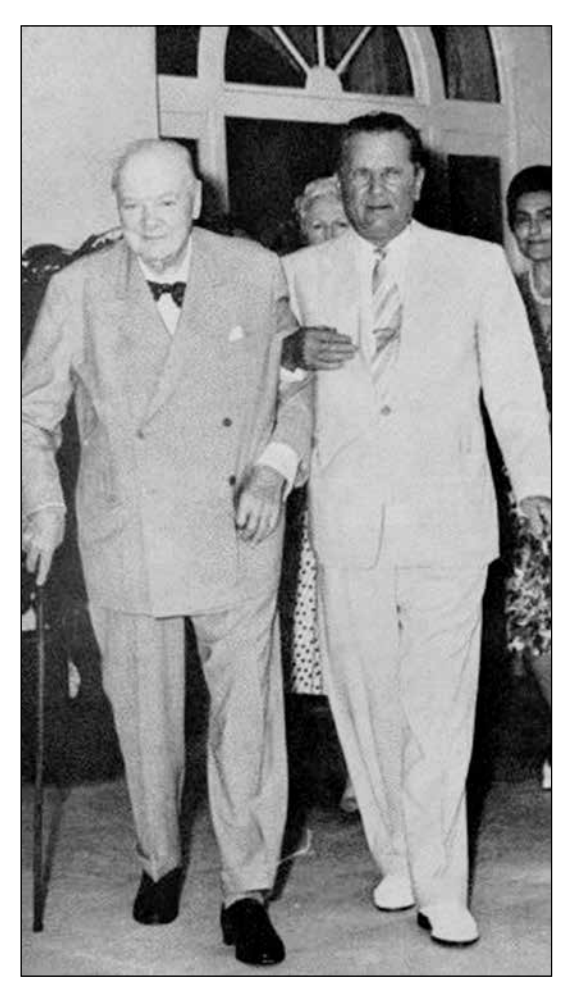
Fig. 9: Tito and Churchill in Split, July 1960. Sl. 9: Tito in Churchill v Splitu, julij 1960.